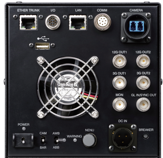
Rear Panel for CCU