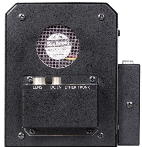
Rear Panel for Camera Head

Design and specifications are subject to change without notice.