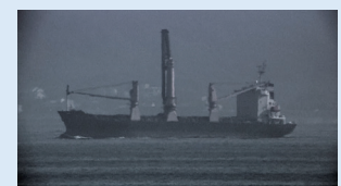
With Variable Contrast Control