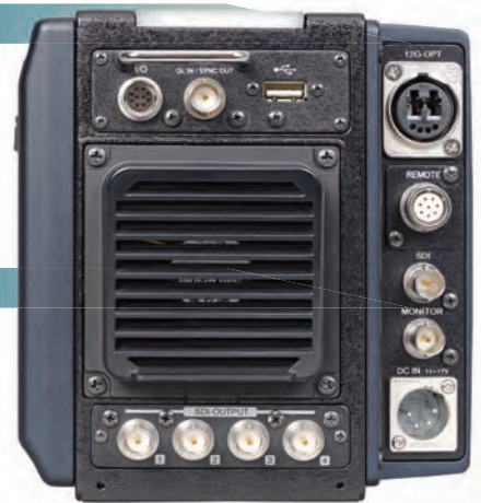
Rear panel of UHL-43 with ICCP/ISCP, 3G-SDI Quad Link, 12G Optical Interface

In addition to ICCP/ISCP and 3G-SDI Quad Link interface, 12G Optical transmission by using a single mode fiber cable is available. With this interface, the camera provides long distance video transmission, which is ideal for applications such as traffic and weather camera, etc.