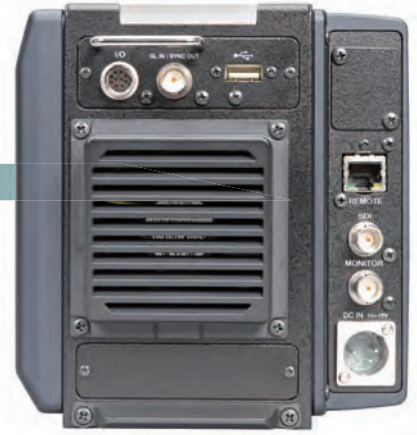
Rear panel of UHL-43