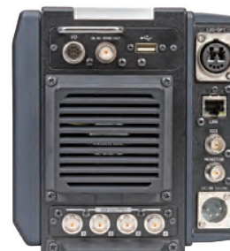
Rear panel of UHL-43 with optional 12G-OPT and Quadlink

Design and specifications are subject to change without notice.