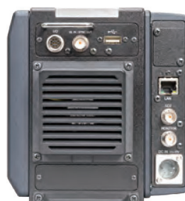
Rear panel of UHL-43(standard)