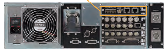
MoIP Module in exchange for the standard 12G_OUT Module

The CCU-X100 in 4K/HD Multi configuration supports Ikegami's flagship 4K/HD camera heads as well as "Unicam HD" HDTV camera heads. There is no need to physically switch the connection path of both systems as they share the same SMPTE fiber receptacle.