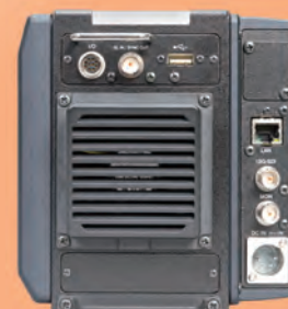
Rear panel of UHL-43

The camera has been designed taking into consideration that it would support 12G-SDI output interface as standard to flexibly support future trends for 4K systems.