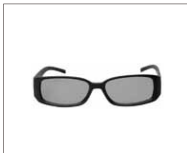
■ 3D Glasses AC70(10pcs/set)