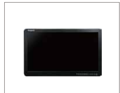
■ 26-inch Medical Grade LCD-Color Monitor MLW-2627C-DC Type-3D

Design and specifications are subject to change without notice.