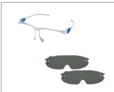
■ 3D Glasses set(Overglass type) KM-0101(Frame x1,Lens x2)